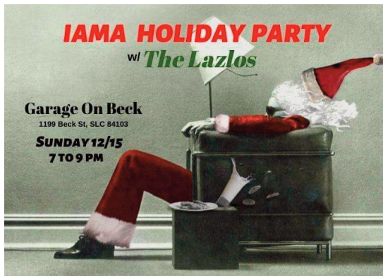
The Lazlos, IAMA Night at the Garage Holiday Edition, Sunday Dec. 15th