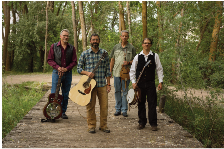
Basin & Grange

These four friends share a love for traditional bluegrass and old-time melodies, along with the creative spirit for taking this music in new directions. This combination of innovation and conservation inspires the band's name. "Basin and Grange" evokes the vast and beautiful region of the American West (the Basin & Range), home to the band members, and a symbol of exploration and freedom. "Range" is playfully adapted to "Grange", calling to mind the country roots of this group's music.