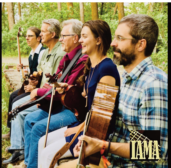
Basin & Grange

Admission at the door $7 for IAMA members