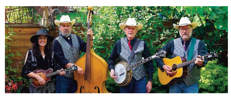
The Grey Hounds

Intermountain Acoustic Music Association, P.O. Box 520521, Salt Lake City, Utah, 84152