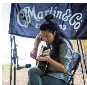
some of the USIC