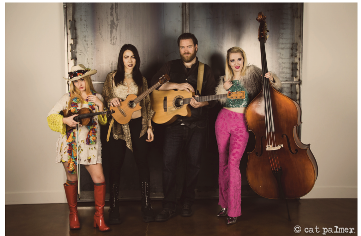
The Backyard Revival

Admission at the door $7 for IAMA members